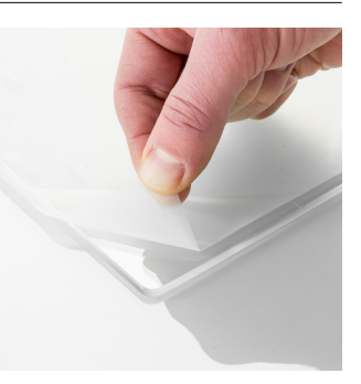
Adhesion sheets x25 For effective build plate adhesion

Add a front enclosure, extra nozzles, and adhesion sheets